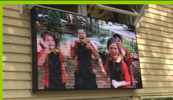
Our new screen can display images and videos.

Our Vision "At Montville State School, we value creativity, diversity and sustainability. We aim to ensure every student is included, engaged and successful. We provide learning opportunities that are fun, challenging and supportive for all students. We seek ways to enhance student learning and well-being by welcoming families and the local community to be actively involved in our school."